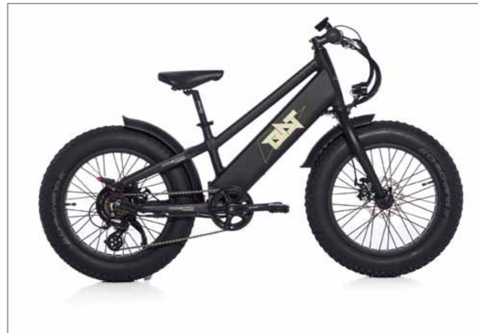
The new mini Crossover signed BadBike